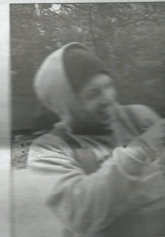
Volunteers with the Benzie County Stream Monitoring Program are testing the health of area rivers to test the health of programs the conservation district.

“If there was no millage, we would not be here.”